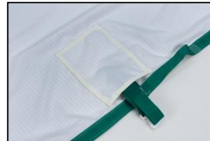
Buckles in pockets