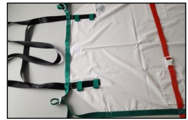
Option: Straps in 3 different colors