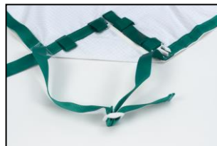
Corner sheet adjusters