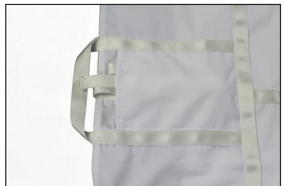
Buckles in pockets