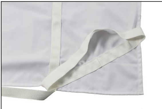
Suitable for all mattress heights