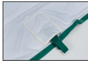
Buckles in pockets