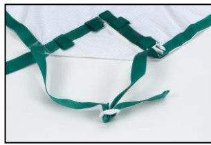
Corner sheet adjusters