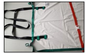
Option: Straps in 3 different colors