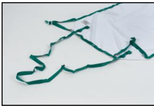
Extra-long towing straps