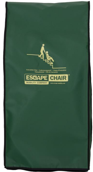
Heat and flame resistant Dust cover